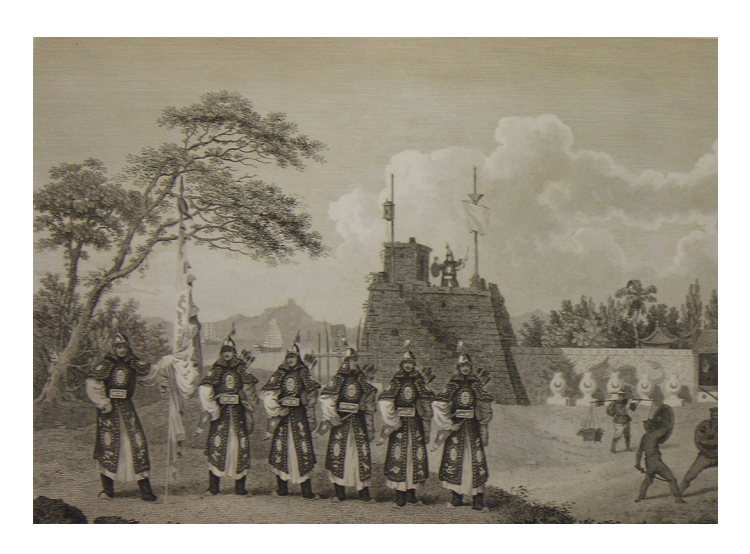
A Chinese Military Post

This five-volume set of gems is kept in a fire-proof safe in the Fung Ping Shan Library. For enquiries, please approach the Special Collections counter.