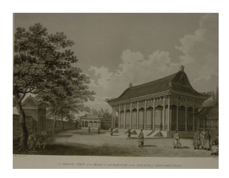
A View of the front of the hall of audience at the palace of Yuen-men-yuen