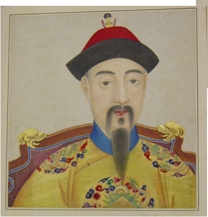
Flowers of Cotton Tree